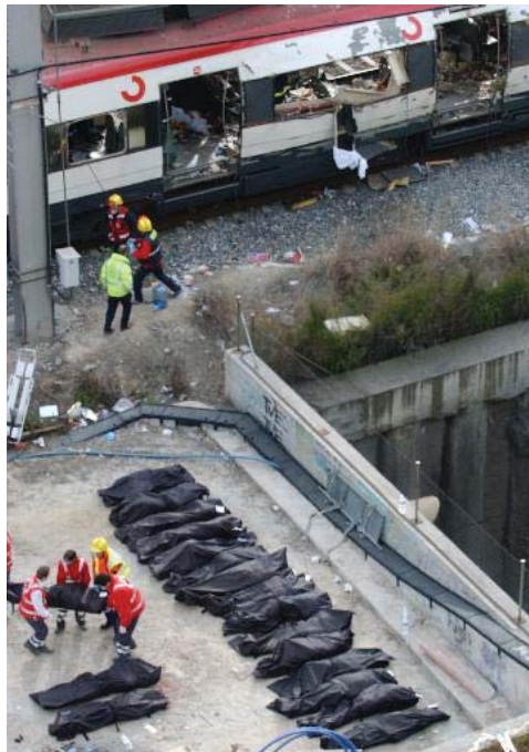
Rescue workers line up bodies beside a bomb damaged passenger train at Atocha station following a number of explosions on trains in Madrid Thursday March 11, 2004, just three days before Spain's general elections, killing more than 170 rush-hour commuters and wounding more than 500 in Spain's worst terrorist attack ever.

Immediately after the attacks in Madrid, Prime Minister Aznar and government officials blamed the ETA. However, opposition parties (including Batasuna which has been declared illegal by UN and is considered the political voice of ETA) and international media developed different thesis connecting the attacks with Islamic terrorist organizations. Insurmountable evidence gathered later proved that an Islamic group possibly connected to al-Qaeda was indeed